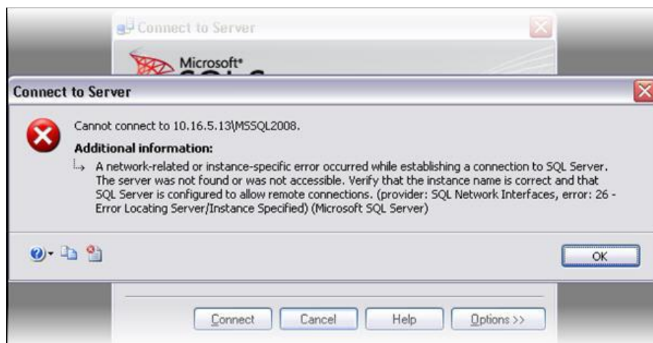
Error message when SQL Server browser service is stopped

Try to login again with the same parameters as before. This time you will get a message like the following.