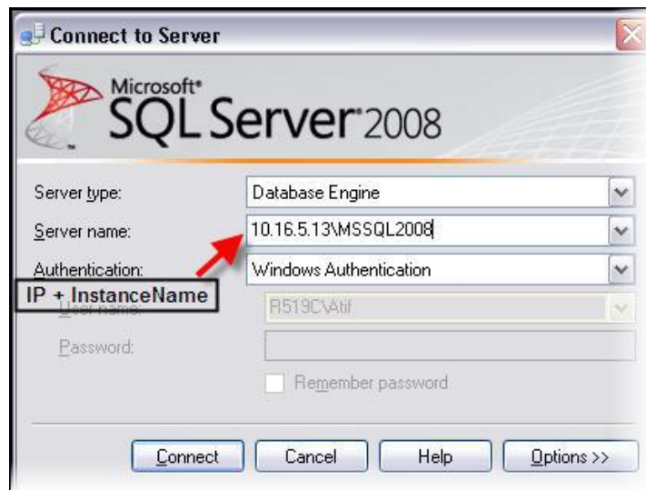
Access SQL Server instance with IP and instance name

When the browser service is running, I can access the instance without a specifying the port. I can successfully login with the following connection parameters (IP + InstanceName).